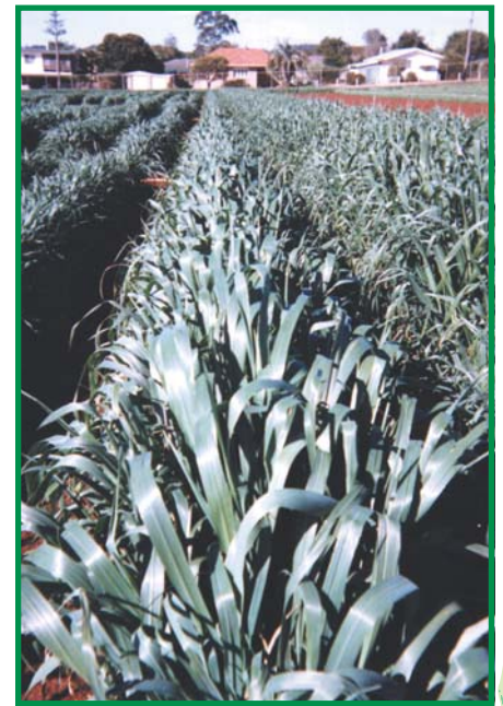
Riel oat with its uniform broad leaf produces good quality forage with a high proportion of leaf to stem.