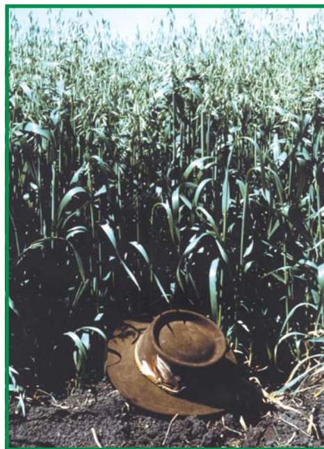
Cultivar Marketing inspect and rogue all their oat seed production crops to ensure the highest varietal purity.